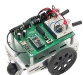
Boe-Bot Programmable Robot Kit