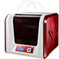
da Vinci Jr. 2.0 Mix Wireless 3D Printer ...