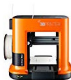
da Vinci Mini Wireless 3D Printer ~ 6"x6"x6...