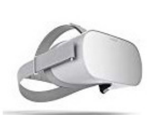
Oculus Go Standalone Virtual Reality Heads...

Prize Selection Number: _____ (Only One Prize per Sheet)