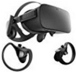
Oculus Rift + Touch Virtual Reality System

Prize Selection Number: _____ (Only One Prize per Sheet)