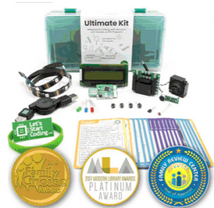
Let's Start Coding