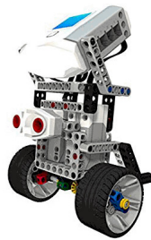
RoboticsU | Ultimate Custom Self Driving Robots Vehicle Kit