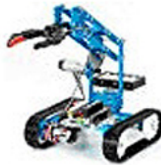
Makeblock Robotic Kit